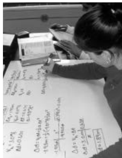
Physics student Jennie Walker solves problems in the study of projectile motion in preparation for designing a trebuchet

This is a listing of gifts received as of 6/30/03. If your gift was received since then, it will be listed in next fall's Foxcroft .