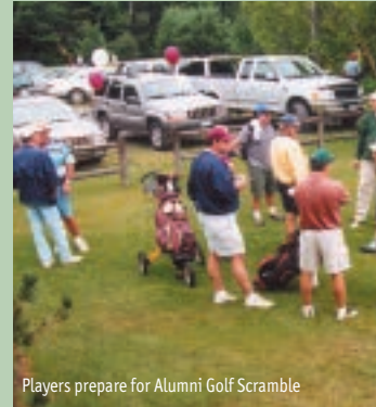
Players prepare for Alumni Golf Scramble